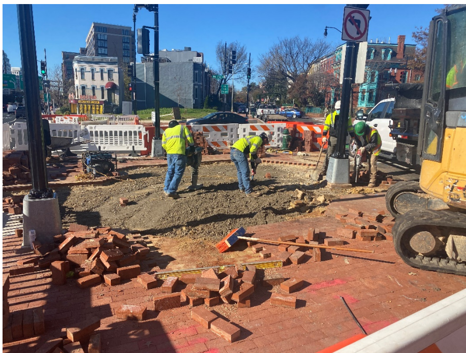
Picture No. 1: 11/16/2020 – Removal of tree space and installation of brick sidewalk installation at the NE corner of NY Ave and NJ Ave (West View)