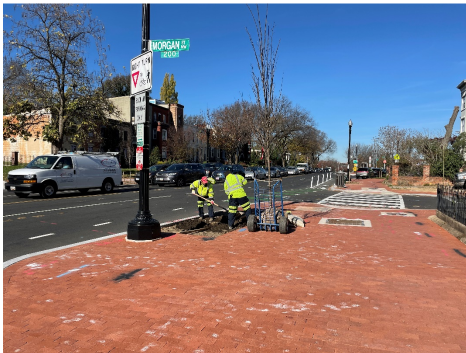
Picture No. 9 – 11/20/2020 – Installation of tree at SE corner of NJ Ave and Morgan St (North View)