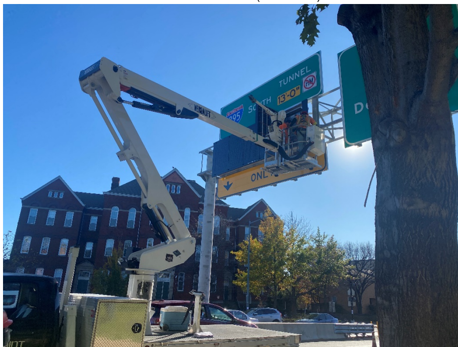
Picture No. 2: 11/16/2020 – Wiring of DMS board along westbound NY Ave near Kirby St (South View)