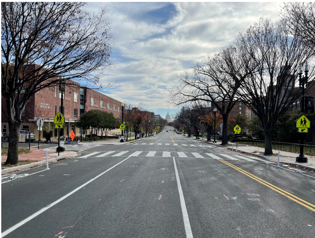
11/19/2020 – Final pavement markings on New Jersey Ave (South View)

Project Website: www.newjerseyaverehab.com