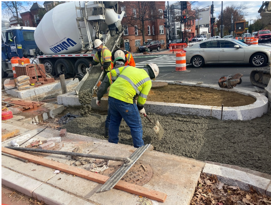
Picture No. 5 – 11/18/2020 – PCC base placement around median at NW corner of NY Ave and NJ Ave (East View)