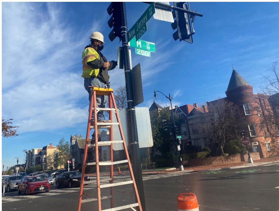
Picture No. 6 – 11/18/2020 – Installation of traffic sign panels at NJ Ave and M St (North View)