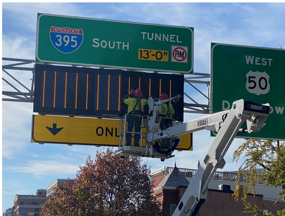
Picture No. 7 – 11/19/2020 – Powering and programming DMS along NY Ave near Kirby St. (West View)