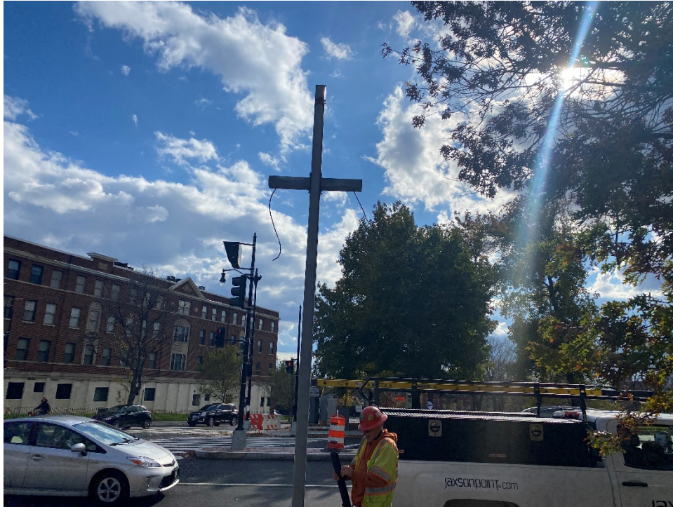
Picture No. 3 – 11/17/2020 – Relocating over height detector sensors near NY Ave and First St (south View).