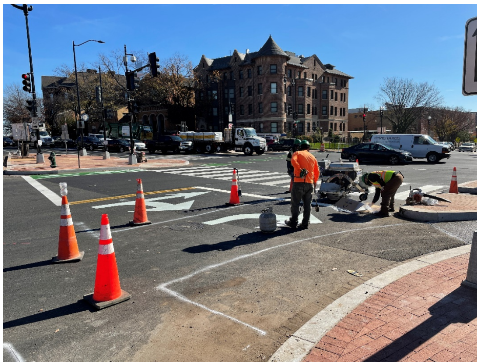
Picture No. 10 – 11/20/2020 – Thermoplastic pavement markings at NJ Ave and NY Ave intersection (South View)