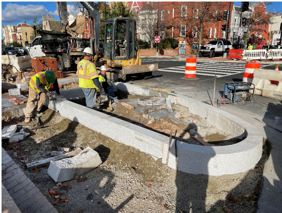
Picture No. 4 – 11/17/2020 – Installation of granite curb at NW corner of NY Ave and NJ Ave (North View)