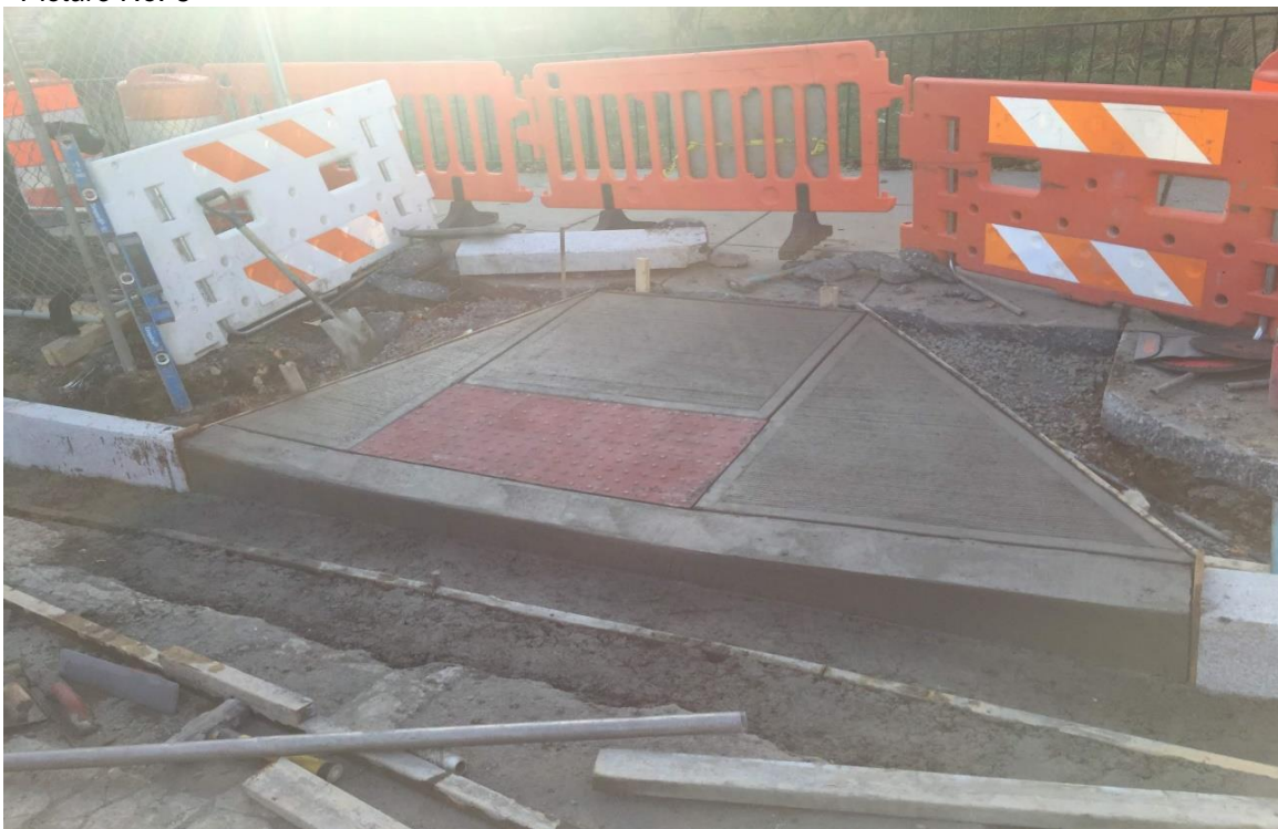
12/12/2019 –Wheelchair Ramp constructed at West side of NJ Ave. NW near Pierce St.