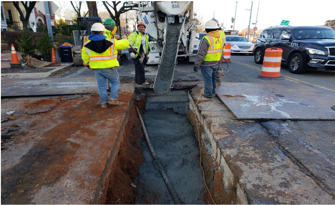
12/12/2019- Conduits Encasement at New Jersey Ave. NW near Morgan St. NW. (North view)