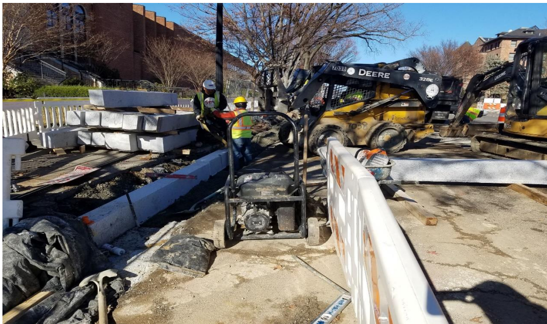
12/11/2019- Installation of granite curb at West side of NJ Ave. NW. between L & Pierce St. (South view)