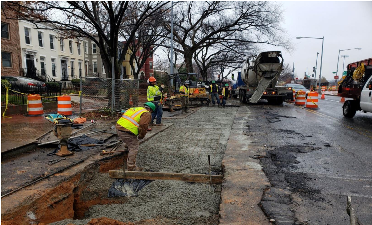
12/13/2019- PCC base construction at NJ Ave. NW between Morgan & N St. NW. (North view)