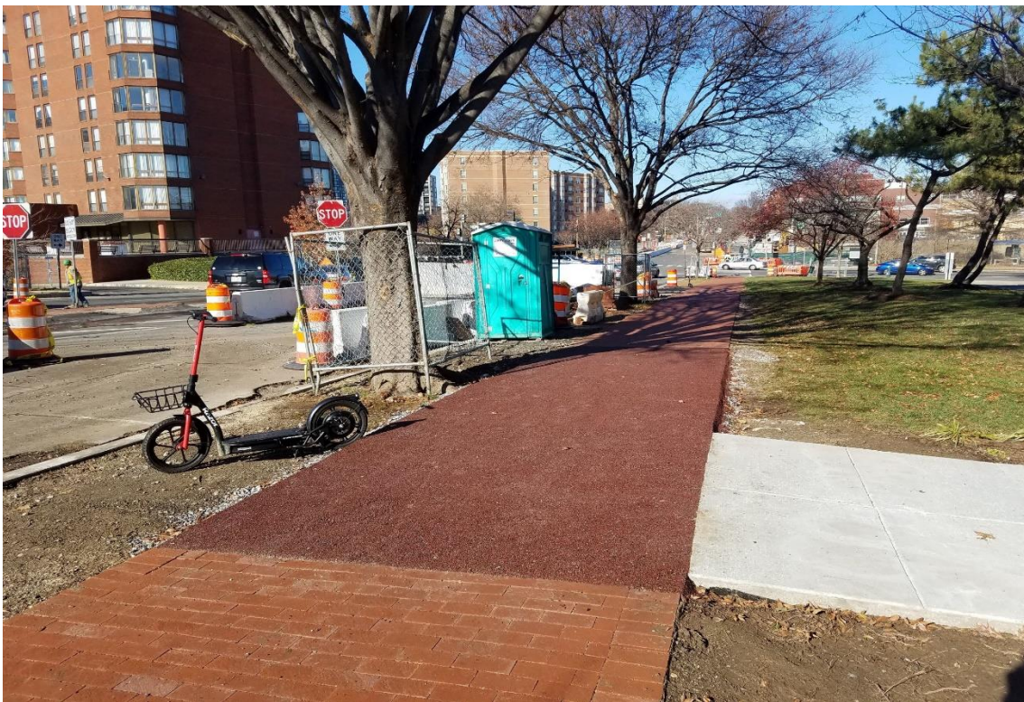
12/11/2019- Brown color Flexi pave installed at East side of NJ Ave. NW between K & I St. NW. (North View)

Project Website: www.newjerseyaverehab.com