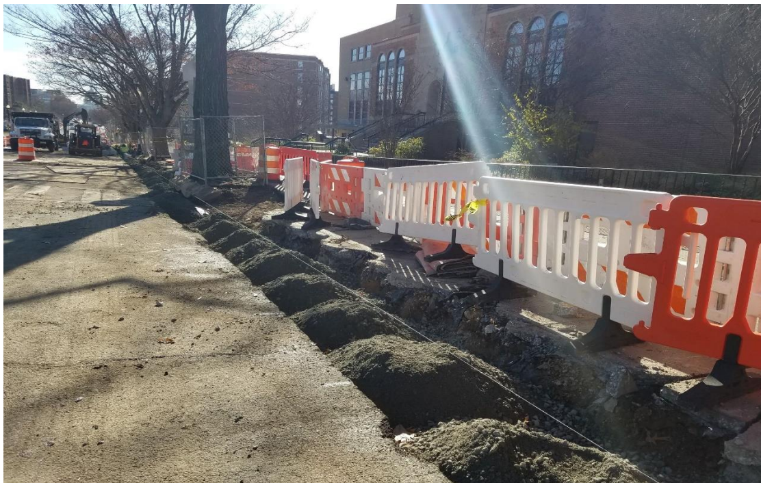
12/11/2019- Placement of dry concrete along curb line between Pierce & NY Ave. NW. (SW view)