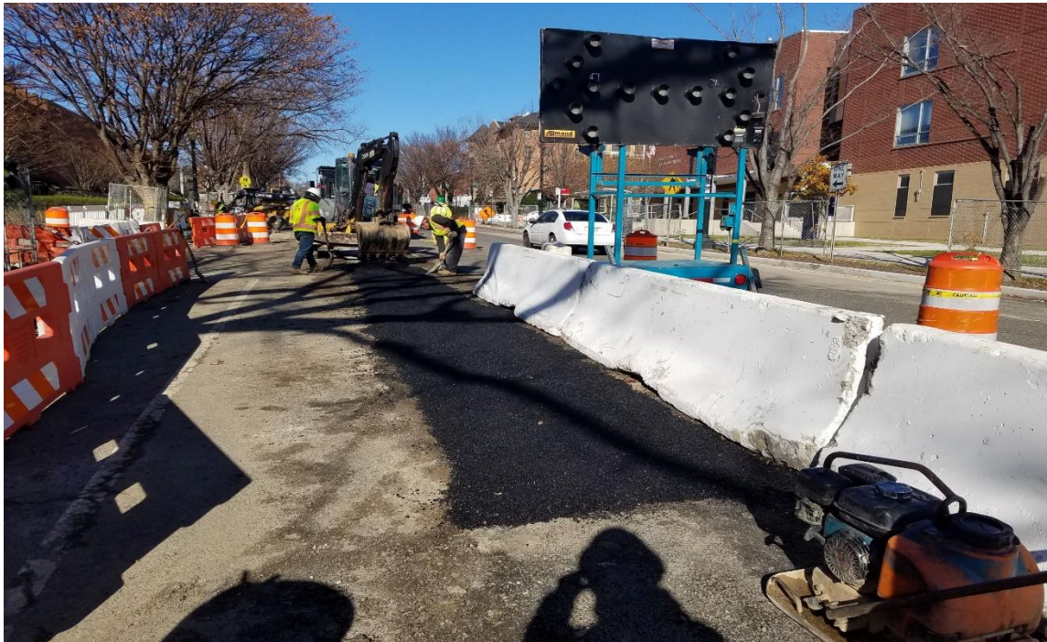
12/11/2019- Trench excavation for electrical conduits installation at NY & NJ Intersection. (West view)