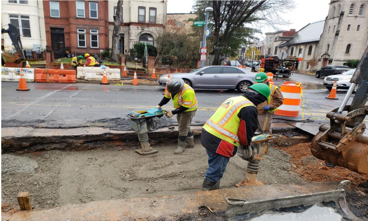
12/13/2019- Compaction to GAB placed on roadway at NJ Ave. NW & Morgan St. NW. (East view) Picture No. 10