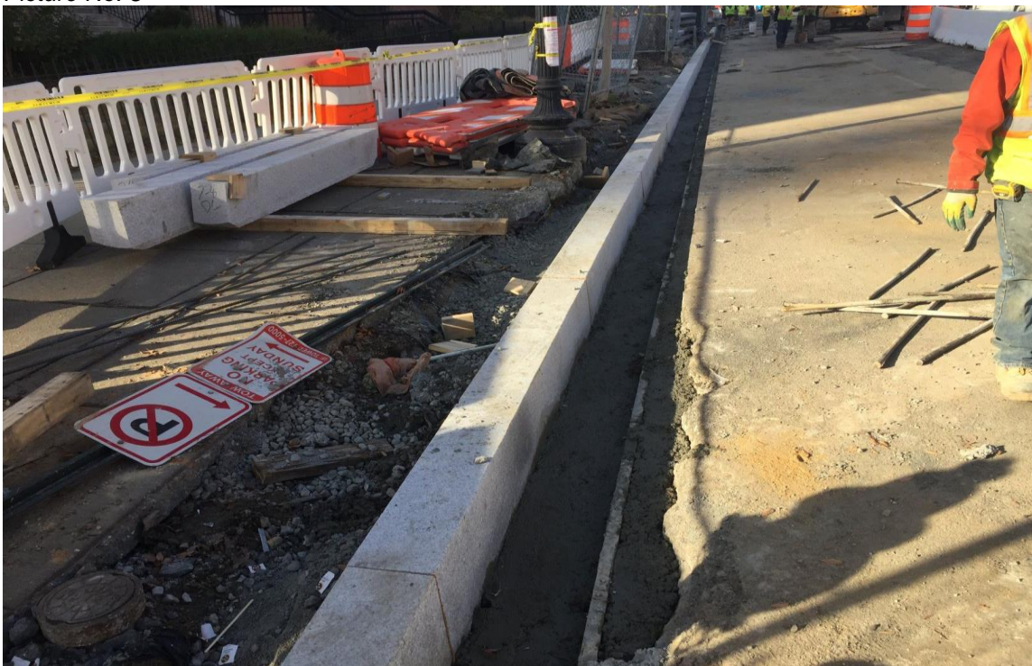
12/12/2019- Granite curb installed at West side of NJ Ave. NW between L & Pierce St. NW. (North view)