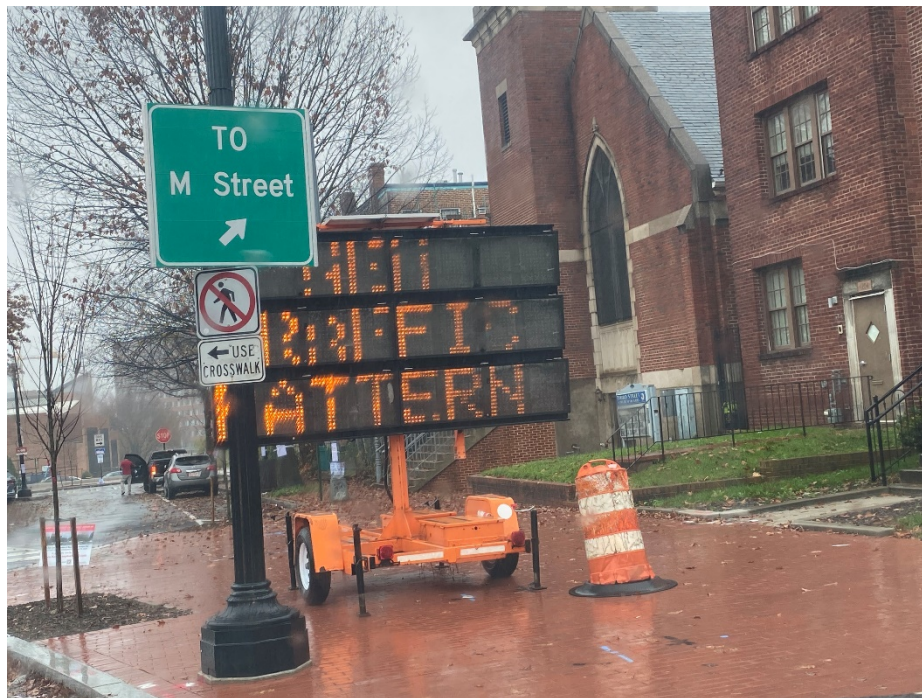
Picture No. 5 – 11/12/2020 – Checking MOT set up along NY Ave between M St. and Morgan St. (South View)