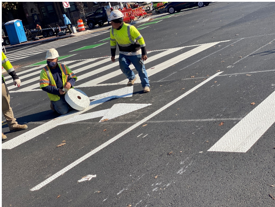
Picture No. 6 – 11/13/2020 – Temporary tape markings being placed along NY Ave and NJ Ave intersection (South View)