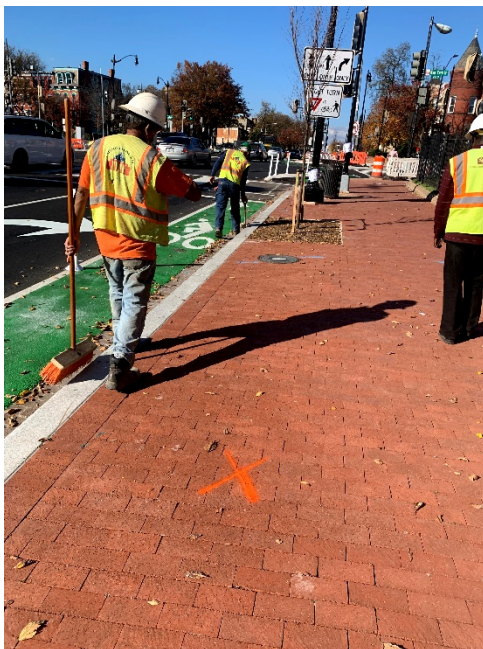
Picture No. 1: 11/09/2020 – Punch List walk through in progress along NJ Ave between H St. and N St. for sidewalk and granite curb (North View)