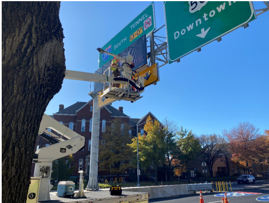
Picture No. 3 – 11/10/2020 – Jaxson Point crew working on the overhead sign structure along NY Ave and Kirby St. (West View)