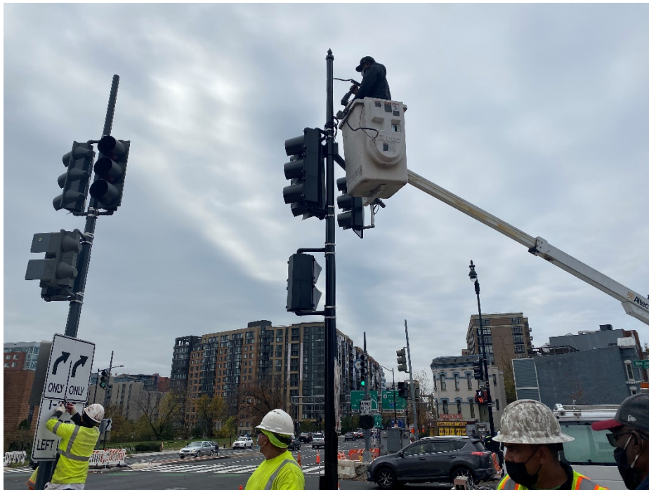
Picture No. 7 – 11/13/2020 – DDOT working on the traffic signals for the lane switch along NY Ave and NJ Ave intersection (West View)