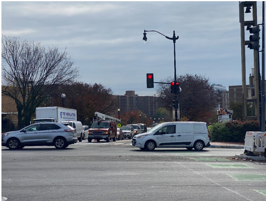
Picture No. 8 – 11/05/2020 – Jaxon Point working on the traffic signals for the lane switch along NY Ave and NJ Ave intersection (South View)