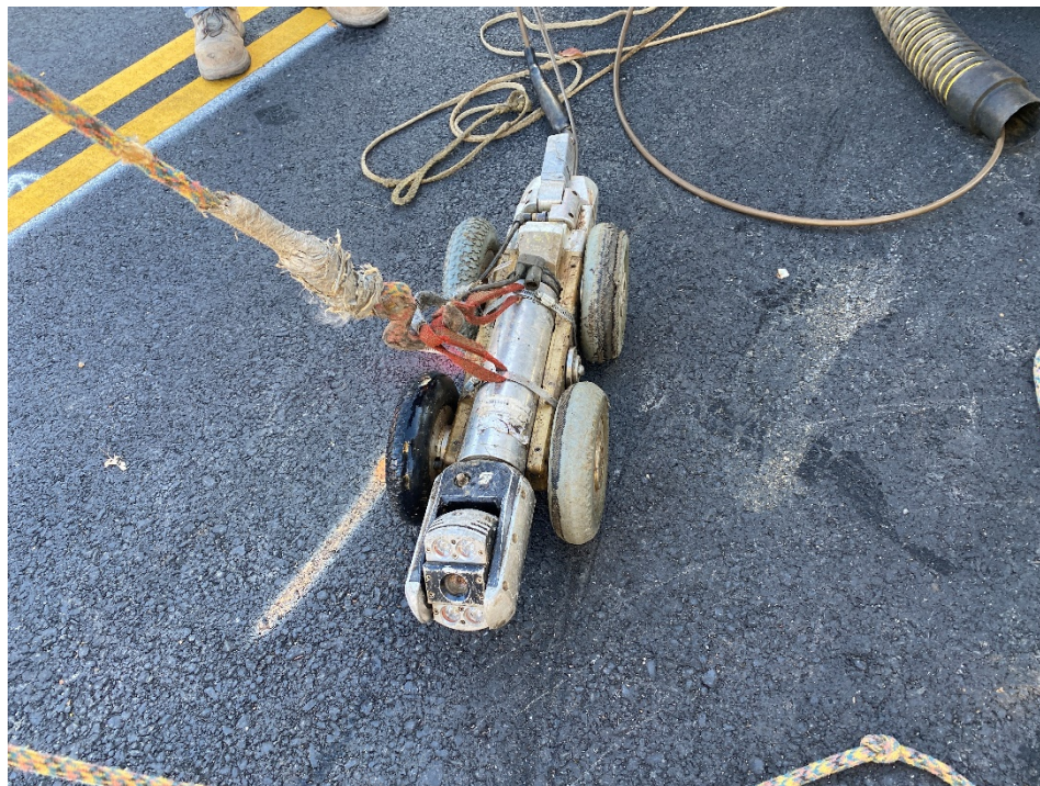
Picture No. 4 – 11/10/2020 – Equipment for CCTV inspection for sewer inspections along NJ Ave