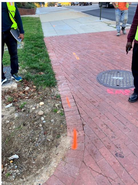
Picture No. 2: 11/09/2020 – Punch List walk through in progress along NJ Ave between H St. and N St. for sidewalk and granite curb (South View)