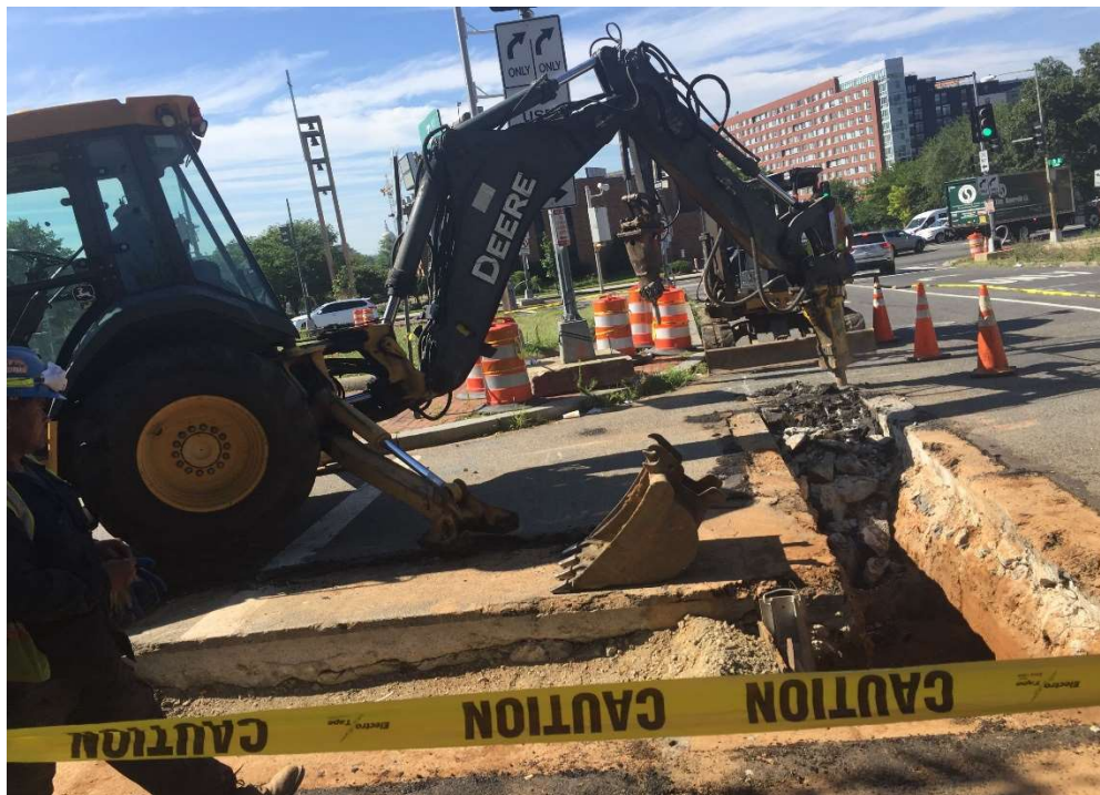
07/15/2019- Trench Excavation for 6" DIP water line at/near 3 rd St. and M St. NW.

Project Website: www.newjerseyaverehab.com