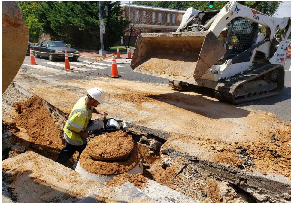
07/17/2019 – Soil backfill for MH-B at NW Corner of K St. & New Jersey Ave. NW