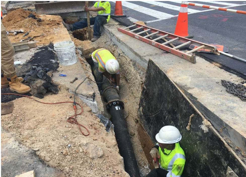
07/16/2019 – 8" DIP water line installation at SW corner of NJ Ave. & N St. NW