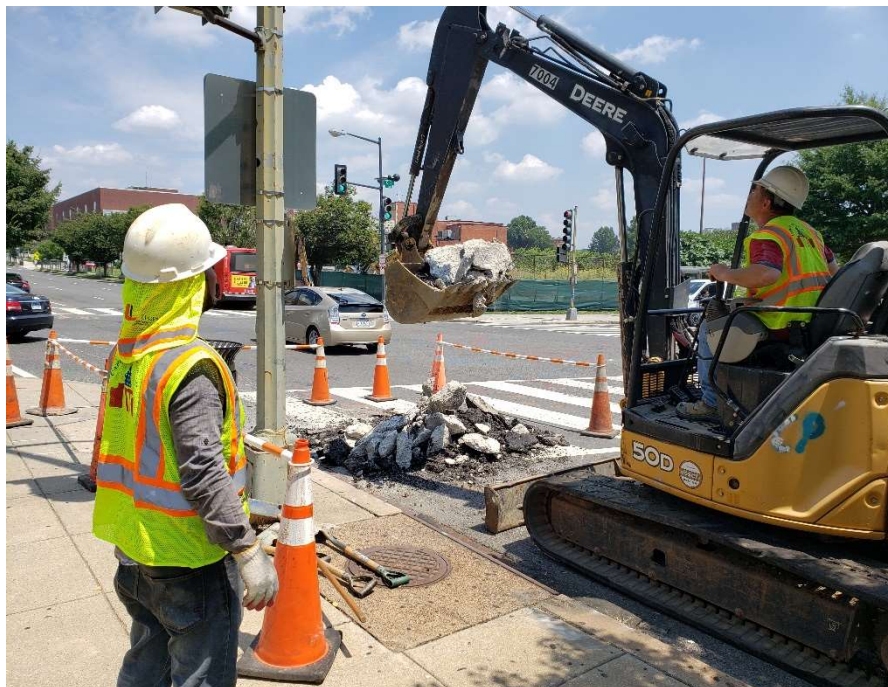
07/16/2019 – Excavation to set up MH-A at SE corner of NJ & K St. NW.