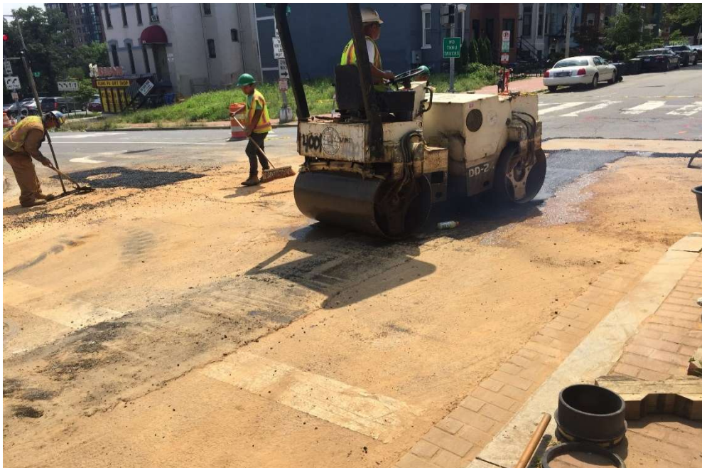
07/16/2019 –Temporary Asphalt Placement/compaction at 3 rd St. & M St. NW.