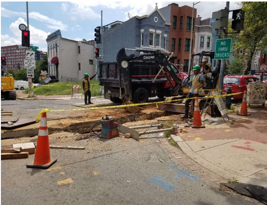
07/18/2019 – Trench Excavation for 8" DIP at Intersection of 3 rd St. & M St. NW.