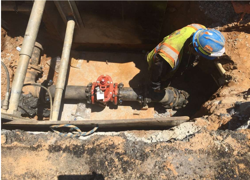
07/15/2019 – Installing Gate Valve at/near 3 rd St & M St. NW (Crossing 3 rd St. NW)