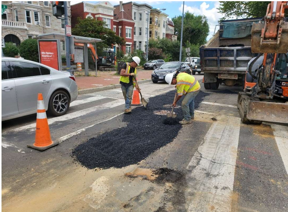
07/18/2019 – Temporary Asphalt Placement at N & New Jersey Ave. NW.