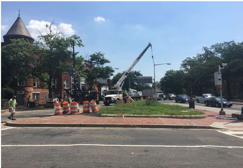
07/16/2019 – Relocate Traffic Light Poles at NW corner of NY Ave. & M St. NW