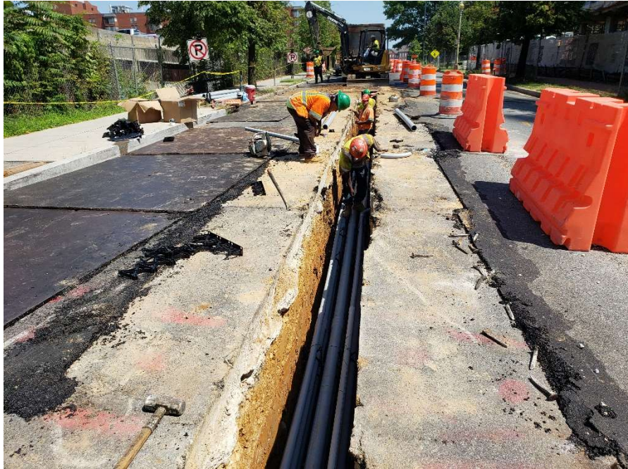
07/16/2019 – Installing PVC pipes for electrical duct bank between MH-16 & L-44.