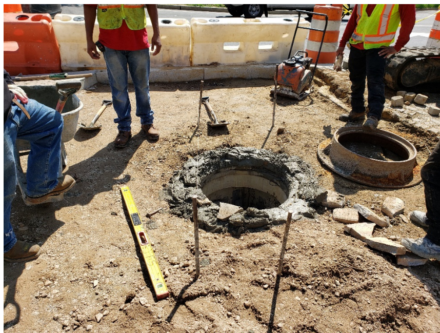
Picture No. 1: 08/10/2020 – Manhole frame being adjusted in the sidewalk at the intersection of NY Ave and 4 th St. (North View)