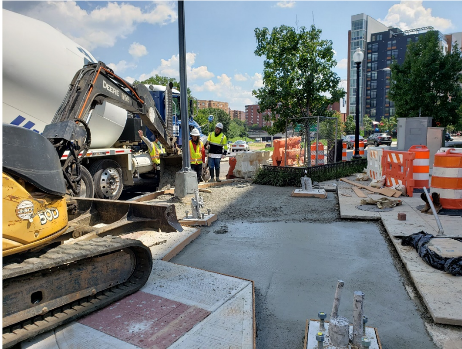
Picture No. 3 - 08/10/2020 – Installation of PCC base for the sidewalk at the intersection of NY Ave and 4 th St. (South View)