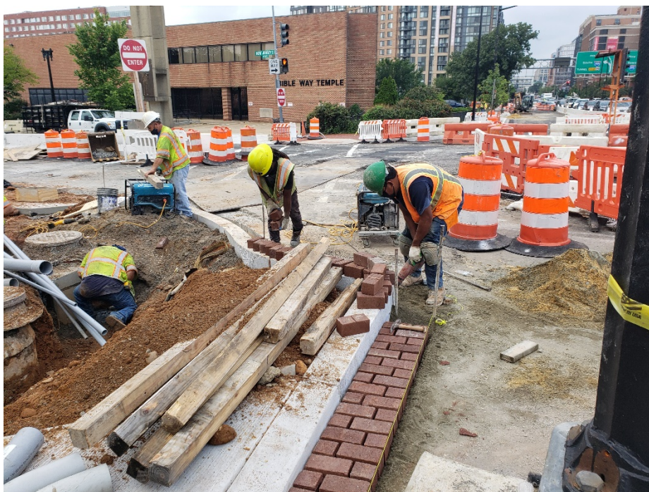
Picture No. 9 – 08/14/2020 – Brick gutter being installed at the intersection of NY Ave and NJ Ave (West View)