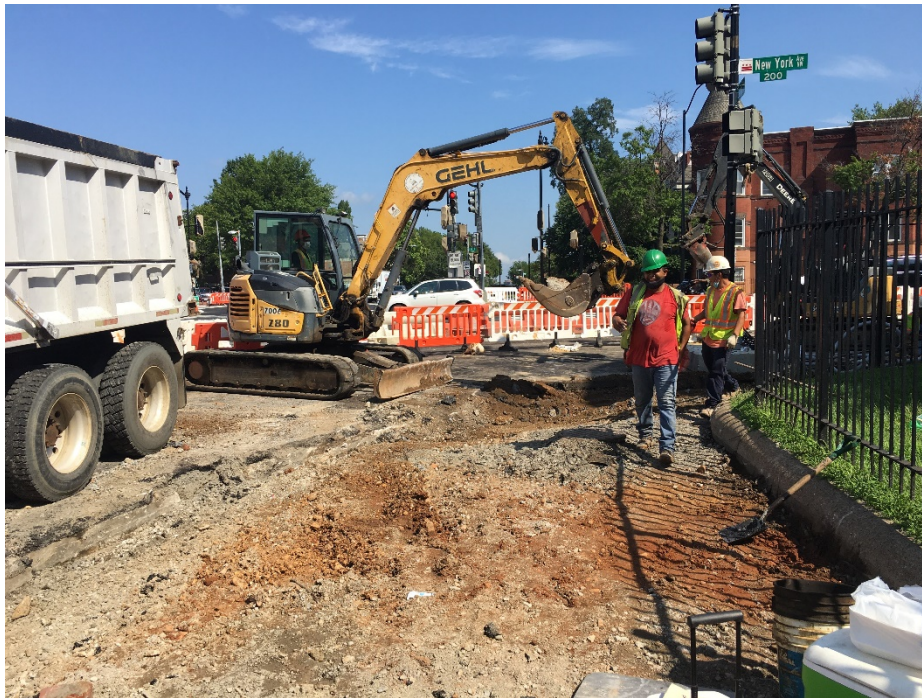
Picture No. 5 – 08/11/2020 – Excavation of existing sidewalk at the intersection of NY Ave and NJ Ave. (East View)