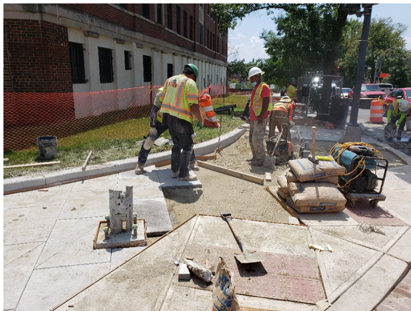
Picture No. 2: 08/10/2020 – Installation of block paver in progress between along NY Ave near 1 st St. (South View)