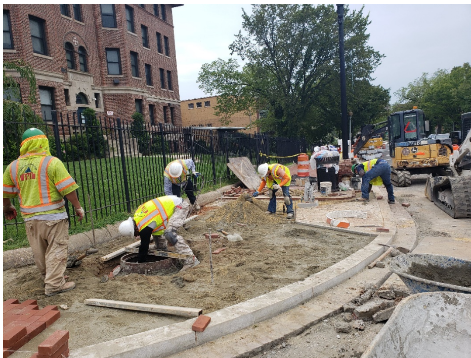
Picture No. 12 – 08/15/2020 – Installation of brick sidewalk at the intersection of NY Ave and NJ Ave (South View)