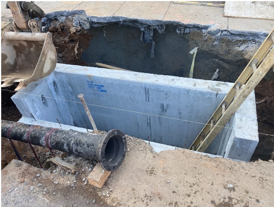
Picture No. 4 – 08/11/2020 – Installation of double catch basin at the installation of NY Ave and NJ Ave SE corner (South View)