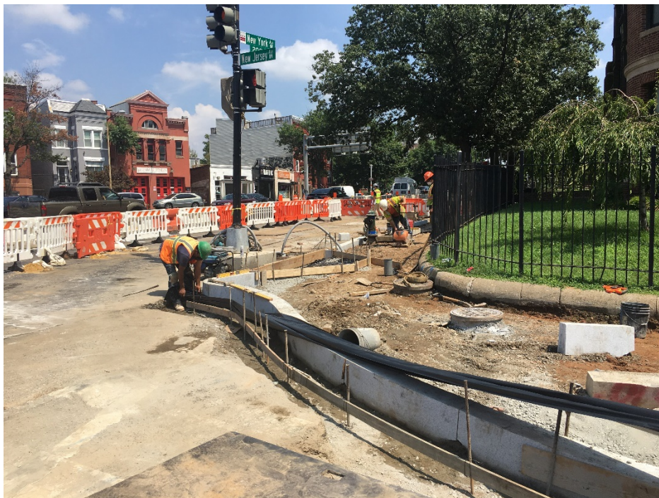
Picture No. 8 – 08/12/2020 – Brick gutter being installed at the intersection of NY Ave and 1 st St. (East View)