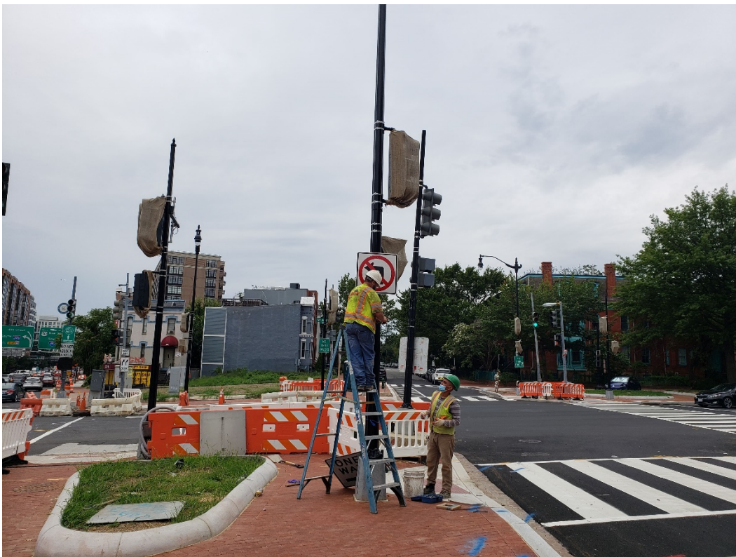
08/15/2020 – Installation of traffic signs at the intersection of M St. and NJ Ave (West View)

Project Website: www.newjerseyaverehab.com