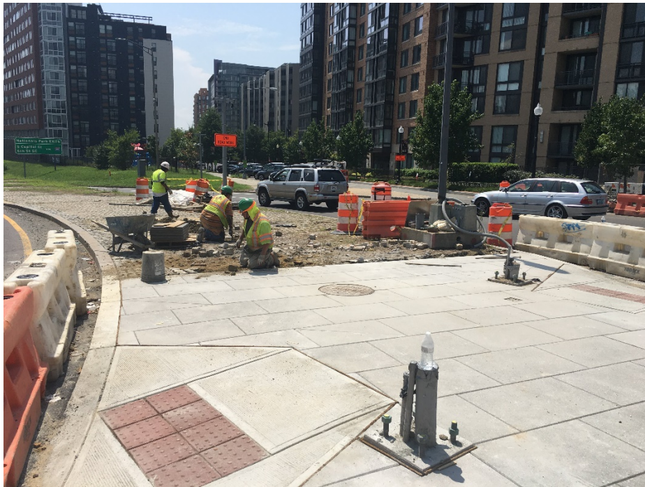
Picture No. 7 – 08/12/2020 – Sidewalk being installed at the intersection of NY Ave and 4 th St. (South View)