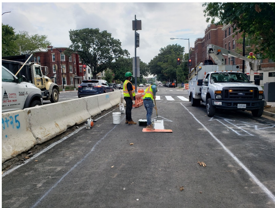
Picture No. 10 – 08/14/2020 – Temporary pavement markings in progress along NY Ave between 1 st St. and M St. (East View)