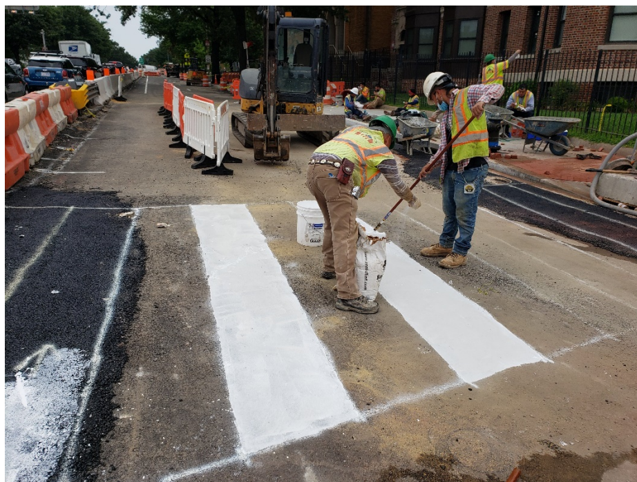
Picture No. 11 – 08/15/2020 – Temporary pavement markings in progress along NY Ave between NJ Ave and M St. (East View)